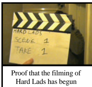
Proof that the filming of Hard Lads has begun

I'd also like a stab at a proper horror movie. The ability to truly scare an audience is the mark of a skilled director, and so the horror genre is often the best test of a directors talents. Of course we will have to finish Hard Lads before we can do anything else, and that will be a test in itself.